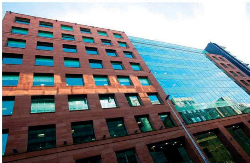
Robertson Street, Office Development, Glasgow